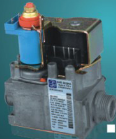
■ Gas valve